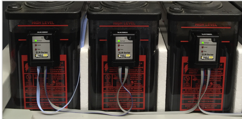
Sensors Installed to Level Line on Flooded Cells

Each sensor has (3) LED lights. A green LED will illuminate when there is no fault. Separate red LEDs will illuminate in the event of level or temperature alarm. The LED's provide quick visual cues to determine the condition of specific cells/units in a string.