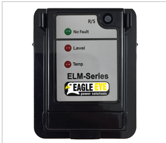
ELM Sensor with Mounting Cradle